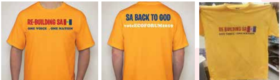
Gold – Divine Nature