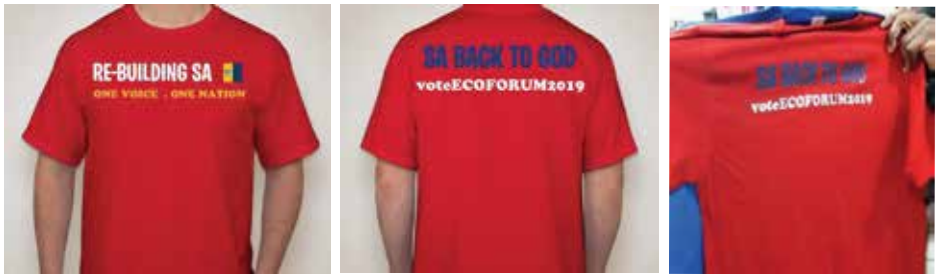
Red – Redemptive Red

NB: All models used on the pictures are utilized for manufacturers discretion.