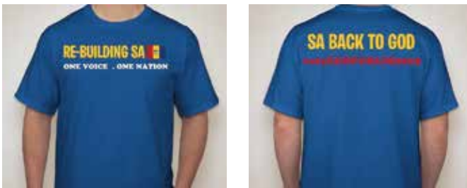
Royal Blue - Royalty